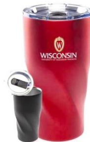
Stainless steel thermos 20oz: $15