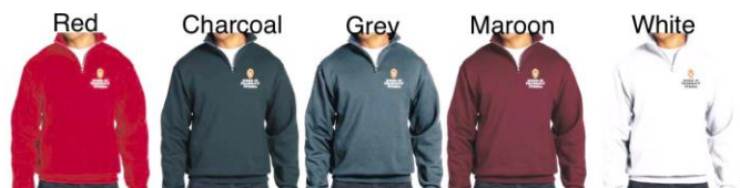
Quarter-zip sweater (S-XL): $40