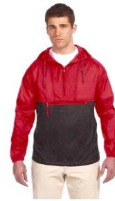
Windbreaker with UW SOP logo (S-XL): $32